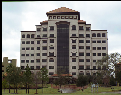
Oasis Medical Office Center