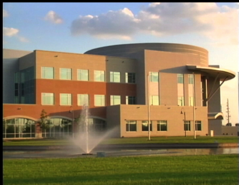
Houston Community College Southwest