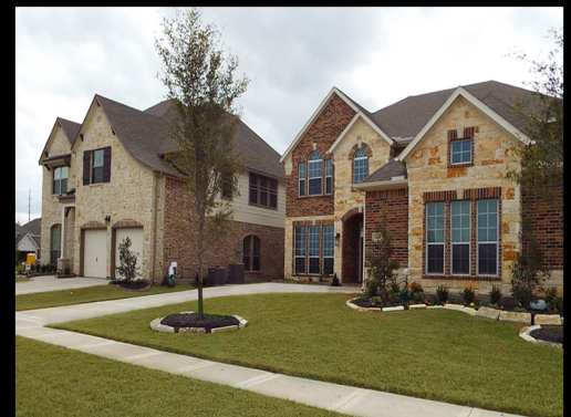
Estates at Promenade